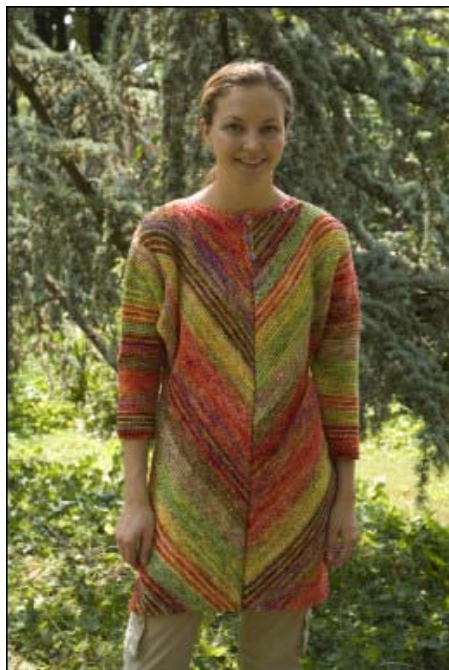
Serengeti Sunrise Tunic